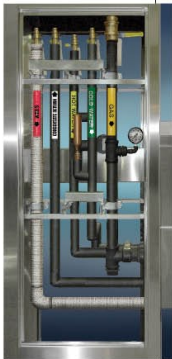
Custom configuration according to your kitchen's specifications

Add, remove, rearrange and service appliances with ease, and eliminate unsafe excess wiring, pipes and clutter